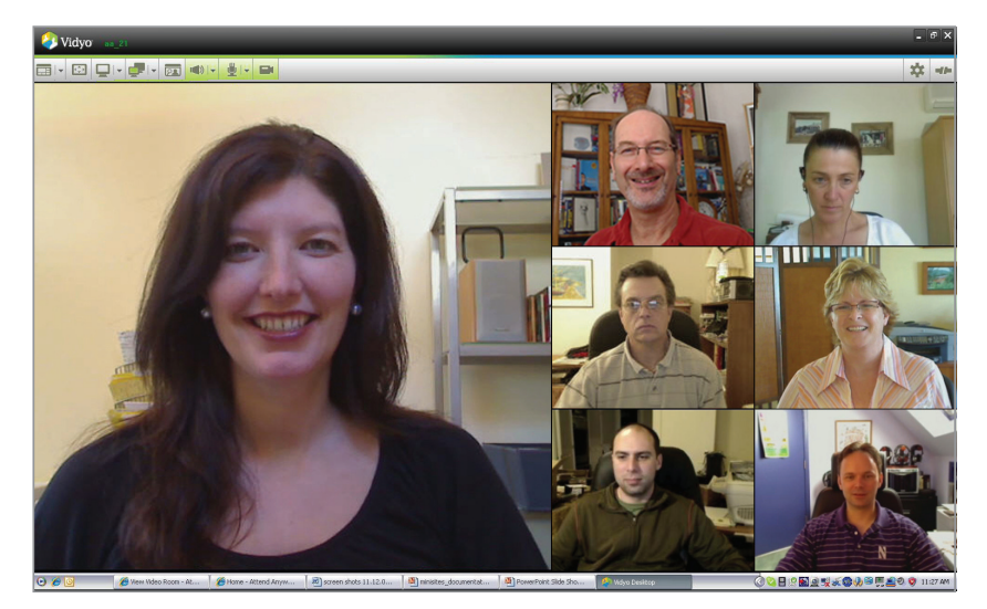
▲ VidyoDesktop application included with VidyoOne.

When a user attempts to access VidyoConferencing for the first time from a Windows PC or Mac via the VidyoOne portal, the VidyoDesktop<sup>™</sup> client software automatically downloads and installs on the user's computer. The VidyoDesktop provides features such as application-sharing and "continuous presence or voice-activated speaker" window, plus a variety of camera and audio controls. All provisioned users have access to their own, reservation-less, virtual meeting room with access controls and the ability to invite guest users as well as other provisioned users. Want to add room systems to your VidyoOne solution? No problem – all of the VidyoRoom models integrate with the VidyoDesktop and each other seamlessly in a blended environment. What's more, VidyoRooms and VidyoGateways do not consume concurrent use software licenses called VidyoLines, making it the most cost effective multipoint platform for room systems available in the market today and leaving all of your VidyoLine capacity available for your VidyoDesktop endpoints.